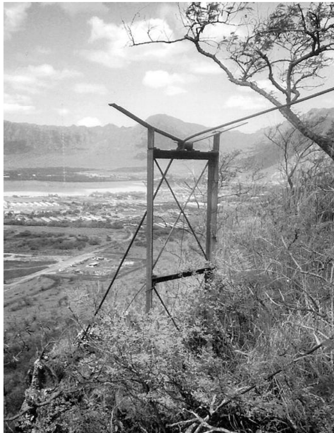
Cableway steel support tower. The Lualualei Naval Reservation is in the background. Guidry