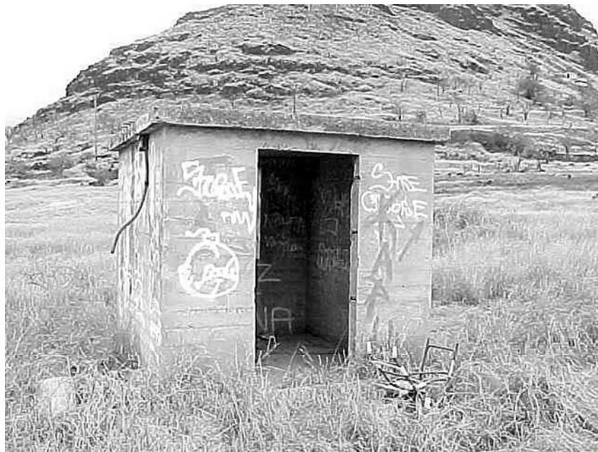
Possible transformer building on Maili MR. Author

The Maili Military Reservation (MMR) consisted of FC Switchboard/Hut “U,” completed in 1929 to service a 12-inch railway mortar-battery firing position at a nearby railroad siding.(47) In World War II, a MG position was established atop the mound adjoining the rear (south) wall of the cable hut. A .30-caliber MG was probably mounted on the galvanized pipe found embedded in the ground.