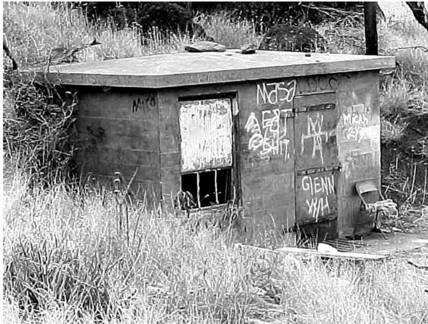
Maili FCSB Room/Cable Hut “U.” Author

100-pair subterranean cable, No. 113, ran from the Ewa Plain up the west coast to Hut “U.”(46) The cable network continued up the coast to Waianae, connecting with a hut at Kaena Point.