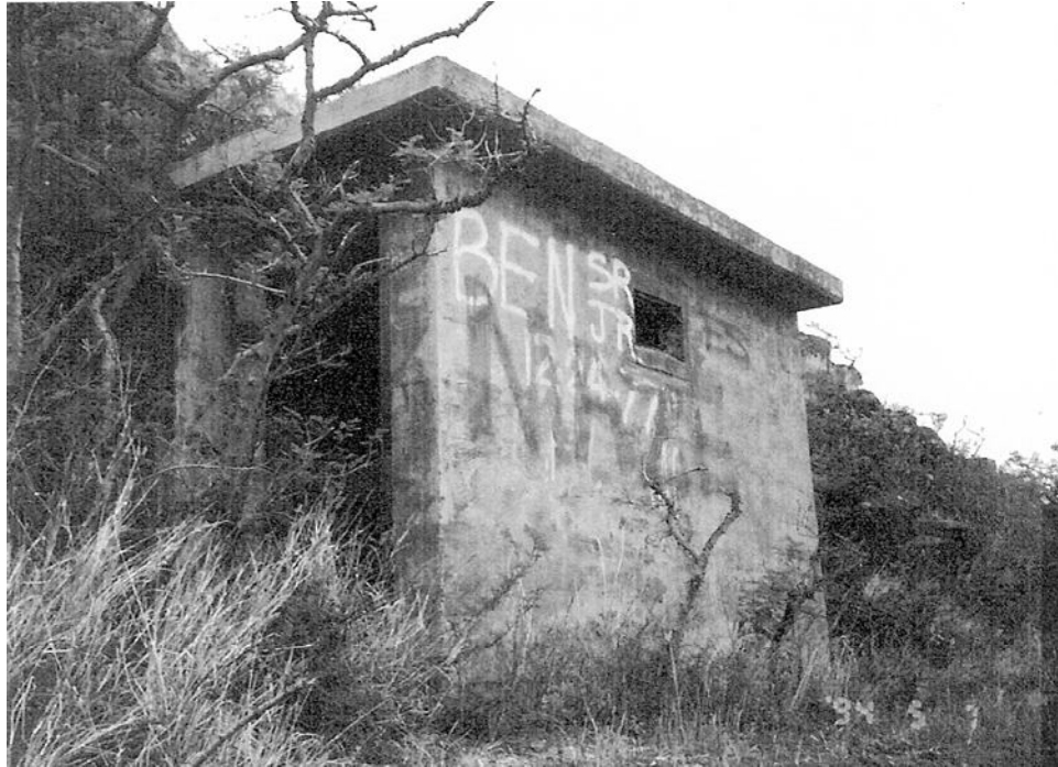
Generator building on reverse slope of Puu-o-Hulu. Guidry

Initial access to the FC stations was via a steep winding trail on the reverse slope. Later an aerial cableway powered by a 6-cylinder GMC gasoline donkey engine was built over a cable right-of-way on the reverse slope obtained in April 1931, to haul material up the steep slope more rapidly.(44) cableway's engine and cable reel were at the end of the line between the northern-most FC station and the Hulu Group CP.