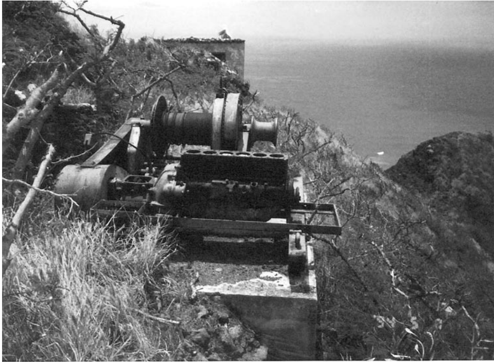
Cable tram motor and cable reel, with generator building above the cable tram assembly. Guidry