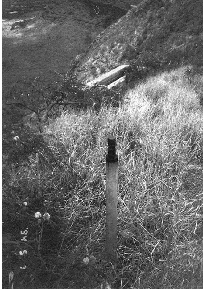
.30 cal. MG pipe-mount between cable tram landing and Hulu Group CP. Guidry

Several temporary buildings on the reverse slope below the crest that supported the men manning the FC stations included two wooden 40-man bunkhouses, a kitchen, storeroom, and a latrine that were completed just prior to December 1940. Electrical power was supplied by a 5 kW 110 V 60-cycle