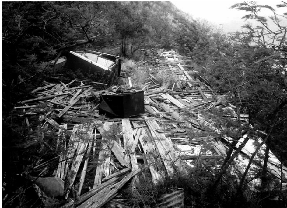
Demolished building atop Puu-o-Hulu, believed to be mess hall and kitchen. Guidry

Initial access to the FC stations was via a steep winding trail on the reverse slope. Later an aerial cableway powered by a 6-cylinder GMC gasoline donkey engine was built over a cable right-of-way on the reverse slope obtained in April 1931, to haul material up the steep slope more rapidly.(44) cableway's engine and cable reel were at the end of the line between the northern-most FC station and the Hulu Group CP.